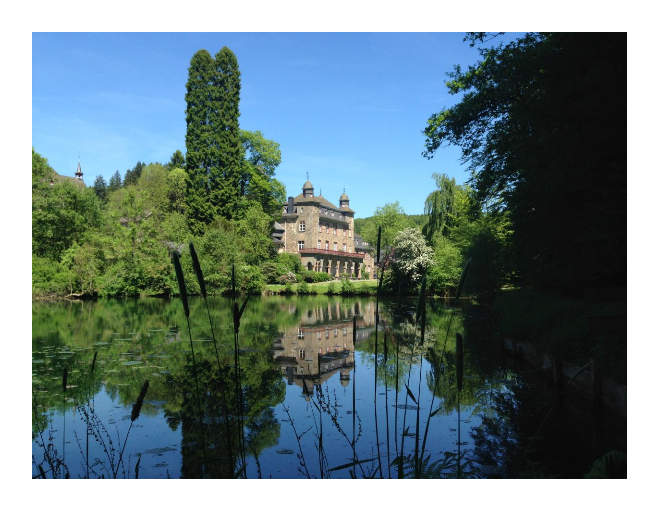
Always worth a visit – be it for education or leisure